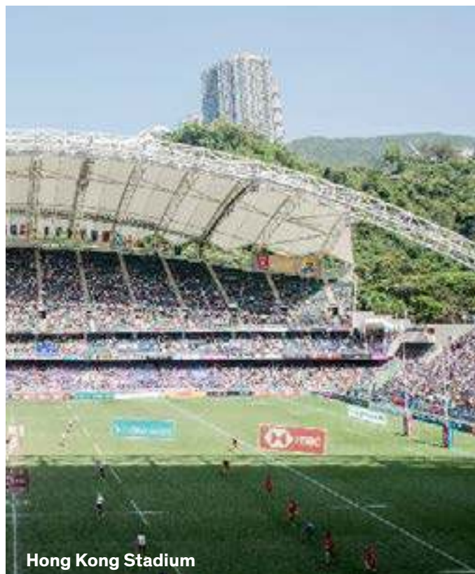
Hong Kong Stadium