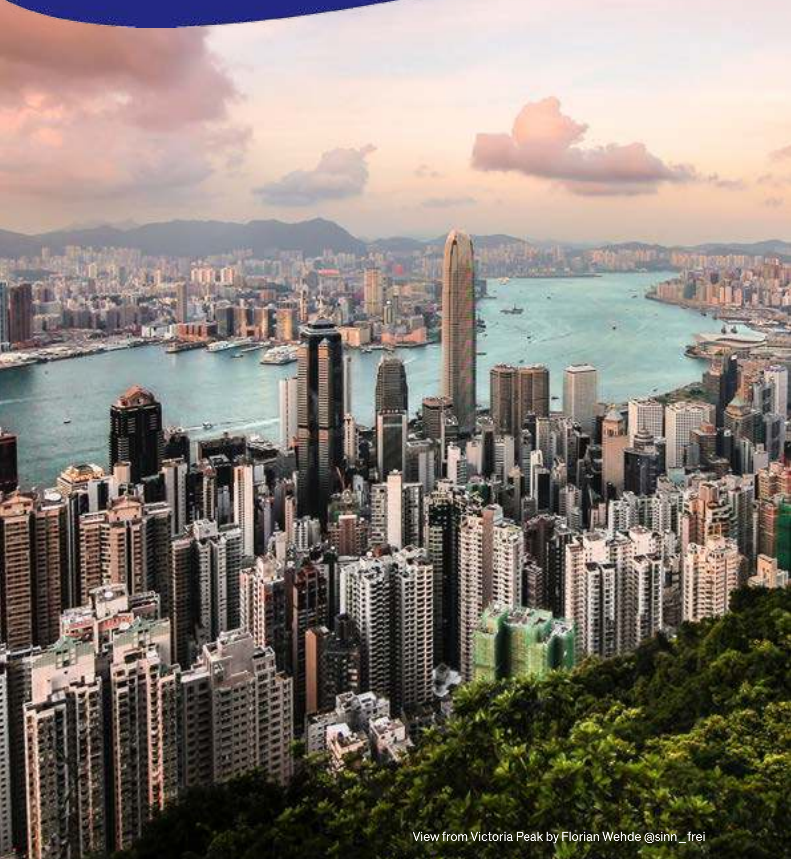
View from Victoria Peak