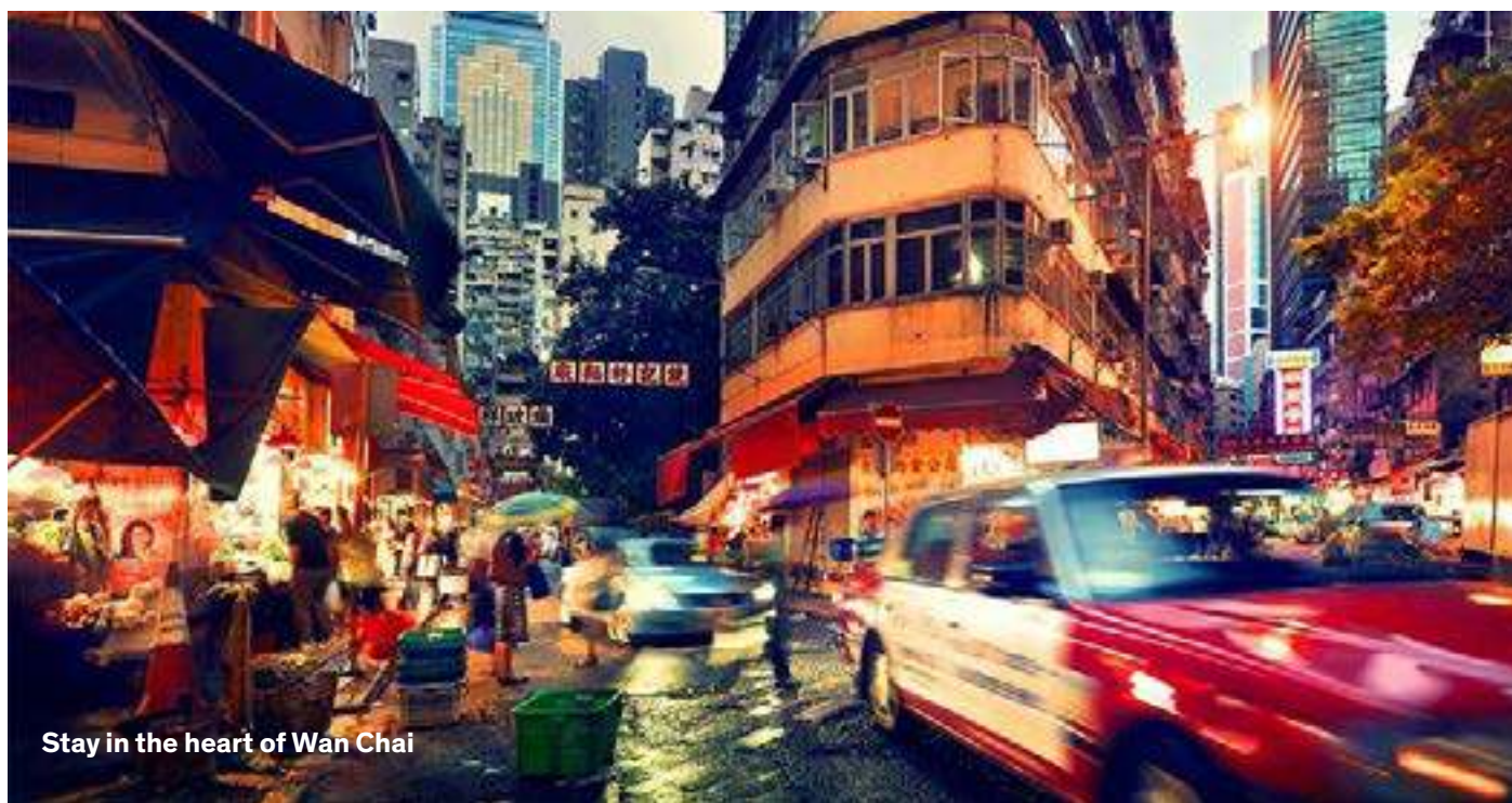
Stay in the heart of Wan Chai

Located near Times Square, the South Pacific Hotel is in a great location to access the stadium, shopping options, MTR station and Wan Chai for great nightlife. Rooms are reasonable sized by Hong Kong standards and good value for an entry level package.