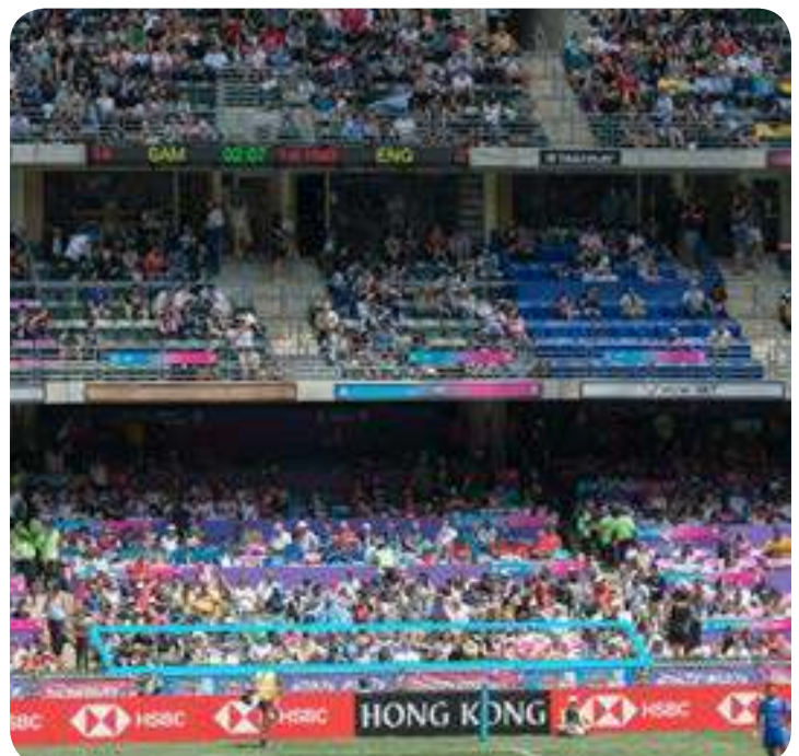
Reserved East Stand Halfway